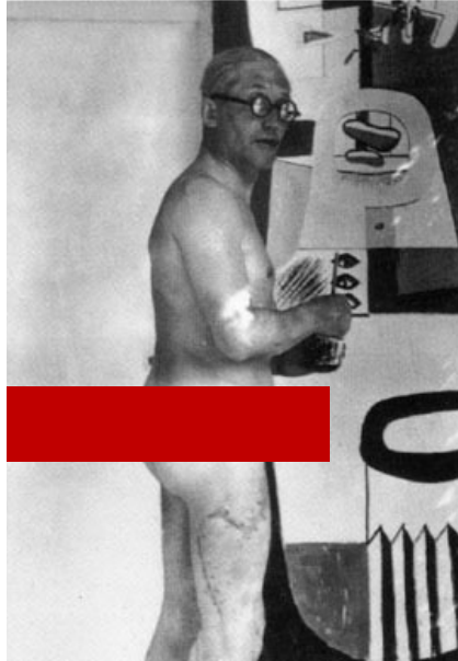
Nudity: an Iconological Dilemma

We typically perceive architecture as being naked when it is unadorned , or when it reveals its structure , or when its material is rough , or when its expression is extremely frugal . A nude architecture is therefore many different things at once. Yet the concept of nude (or naked) architecture is seemingly apparent to everyone. The fact is, even in architecture, nudity is a mystery . St. Augustine recognized this dilemma and so, when asked why a naked body could seem both demure and lustful, he answered that a chaste nudity is not naked, but is dressed in the invisible mantle of grace .