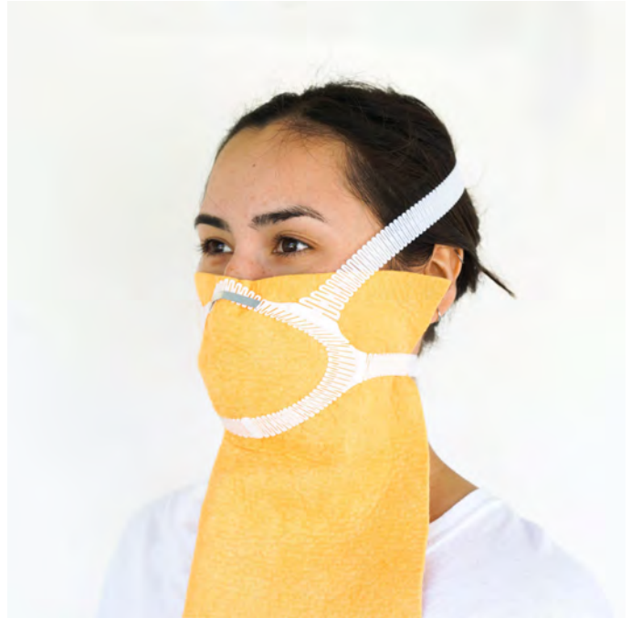
Figure 1 (left) - Selection of work produced in the Sabin Lab @Cornell AAP, Jenny Sabin Studio, and Sabin+Jones LabStudio, 2006 – 2020; Figure 2 (right) – Protective face harness featuring 3-D printed flexible hinge by Sabin Lab as part of Operation PPE 2020