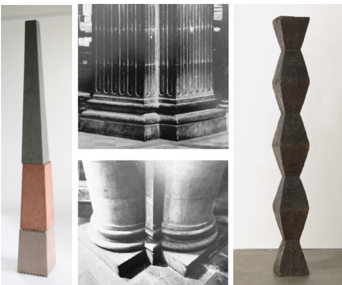
Left : Modular Continuous Column, Architectural Association Visiting School Las Pozas 2015